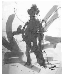
Figurative #1 by B.Petruzzello

Bernie's latest work is in a new show "Sensory Memories" at 119 Gallery, Feb. 26-March 22.