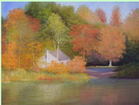
"Fall Pond" pastel painting by Carol Conrad

The Town Offices 50 Billerica Road, Chelmsford: