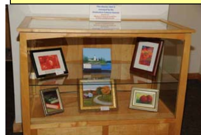
Artwork at December Library Show